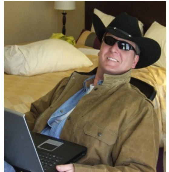
The Original Classified Ad Cowboy

Most people don’t have time for a “business.” I didn’t. That’s why I created the “Lazy Riches” nobody is home cash flow system.